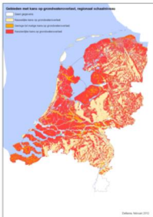
Figure 1. Areas at risk of groundwater flooding, regional scale

The KNMI climate scenarios show a higher incidence of extreme rainfall events, which can present a number of problems in urban areas, as described below. Some of the rain that falls on roofs and pervious and impervious surfaces remains standing until it evaporates, and some infiltrate pervious surfaces. During very intense precipitation events, however, rainfall collects into runoff and discharges into the sewer system. In a mixed system, this water is discharged to the wastewater purification plant together with the domestic wastewater. But when heavy rainfall overwhelms the sewer system, the excess water and all the untreated waste flow directly into the urban surface water, and likely create acute water quality problems. During extreme precipitation events, it is usually impossible to prevent the accumulation of standing water on streets. Not only can this cause traffic obstructions, but also damage to buildings, critical infrastructures and goods - not to